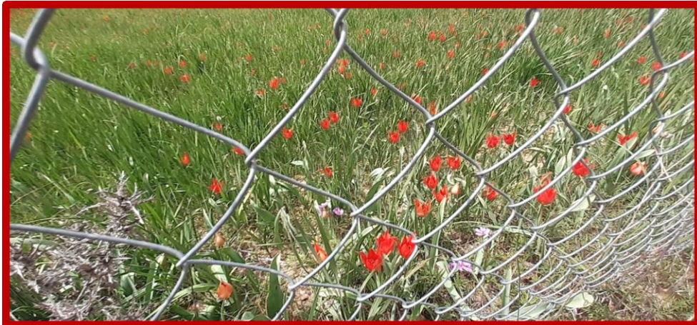
Tulips behind the wire fencing