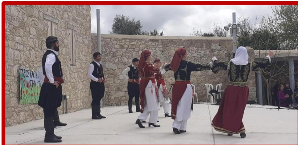
Polaek dance group