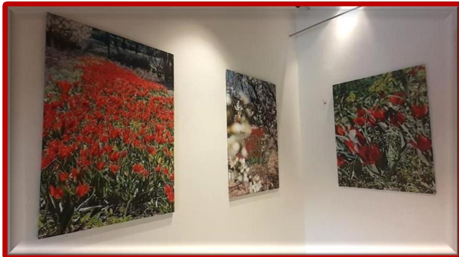
Photos of the tulips

The tulip festival was held on Sunday, April 2nd with a huge number attending. Children dancing and Cypriot dancers, many stalls selling local products. Sadly the main field of tulips had to be enclosed with wire fencing a few years ago due to the fact that people were taking the tulips.